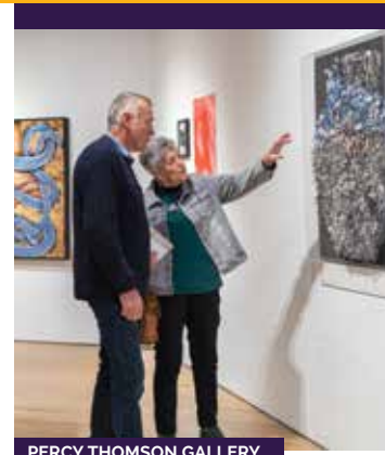
PERCY THOMSON GALLERY

Late Stratford businessman and former mayor Percy Thomson, by his will, left the district a significant bequest towards the establishment and maintenance of an arboretum and herbarium of the native flora of New Zealand, and an art gallery. Located in Prospero Place, the art gallery has received national recognition as a thriving and diverse exhibition space catering for all age groups and interests involving the community at large.