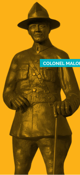
COLONEL MALONE STATUE

There is a lot to see and do, so get going!