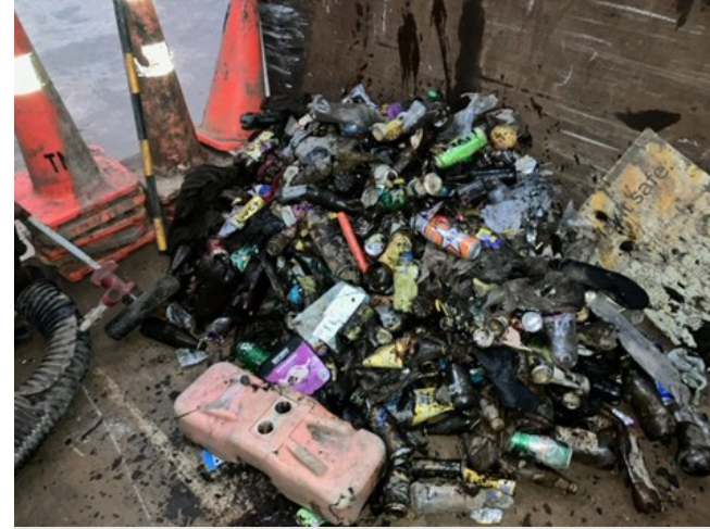
Just some of the rubbish found when the Victoria Park pond was recently drained.

Visit Stratford.govt.nz/FundsAndGrants for more information and criteria, or call us on 06 765 6099. Any information you give us will be kept private.