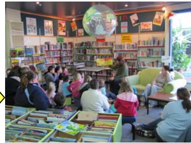
Tot Time on Wednesdays!