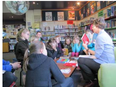
The first Junior Book Club Meeting.

Don't forget Tot Time is every Wednesday at 11.15am and keep an eye out for the Book Festival coming to the library soon!