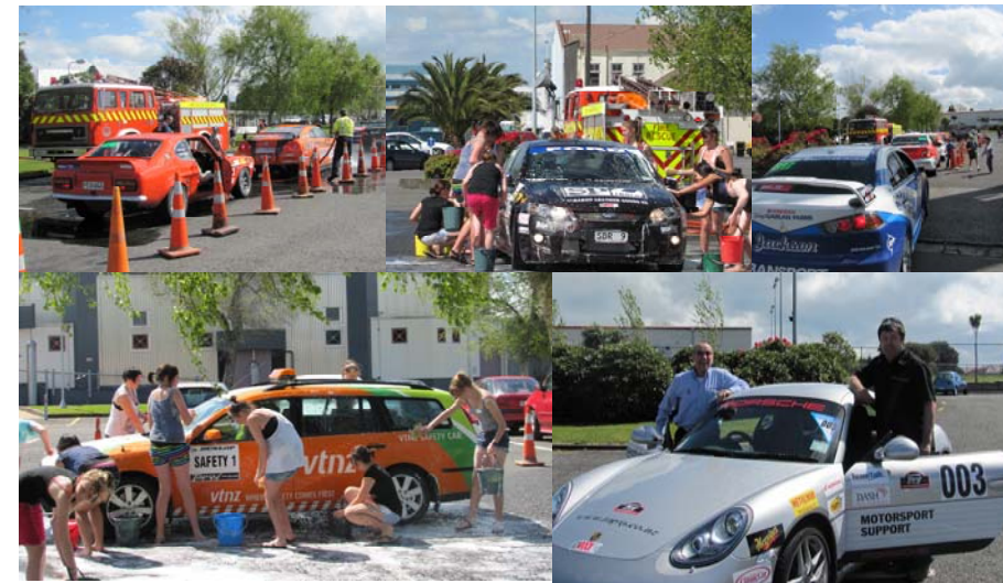
Some of the photos from last week's Dunlop Targa Rally, Wednesday 22 October. Stratford District Youth Council and Stratford High School Netball team put on a carwash for the cars involved.