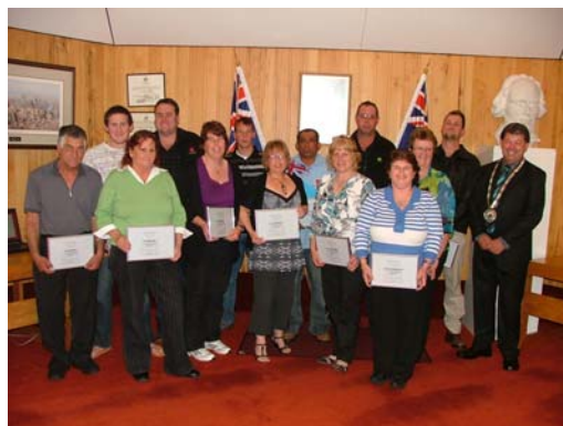
Left: Photo of the 2009 Trade Graduates.