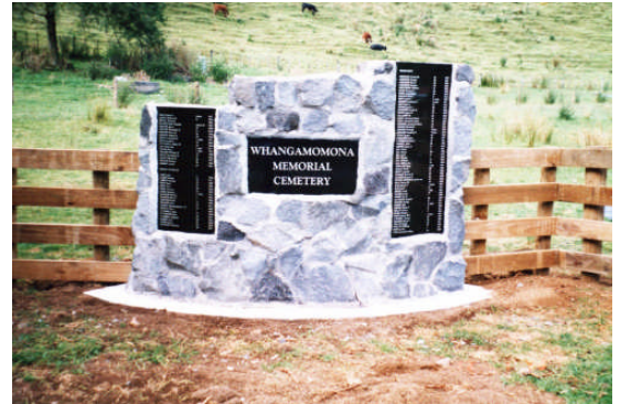
Memorial listing all those who were buried at Whangamomona Cemetery