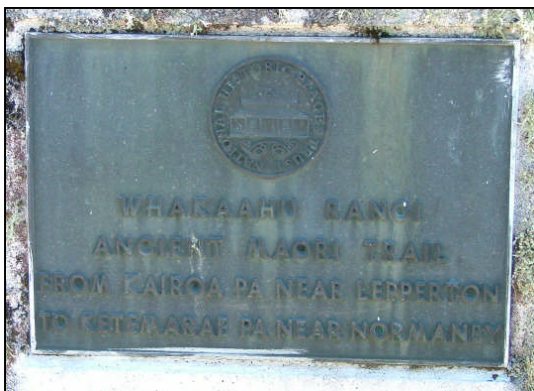
Plaque reads: Whakaahu Rangi, Ancient Maori Trail, From Kairoa Pa near Lepperton to Ketemarae Pa near Normanby