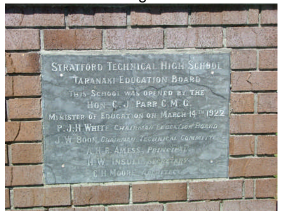
Inscription reads: Stratford Technical High School, Taranaki Education Board, This school was opened by the Hon. C.J. Parr Minister of Education on March 14 th 1922.