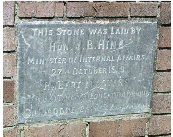
Inscription reads: This stone was laid by Hon. J.B. Hine, Minister of Internal Affairs, 27 October 1919

The 1919 opening roll was 822 students. The sub-committee of the Stratford School interviewed the chairman of the Education Board about the possible erection of the Technical High School on a 14 acre section adjoining the Model Dairy Farm. The Chairman then interviewed the Minister of Education in Wellington, resulting in a grant of £500 being given for the project. The actual provision of funds however, ended up taking another four years and secondary students were forced to remain in cramped conditions at the Juliet, Fenton Streets site.