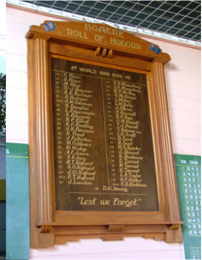
Ngaere Roll of Honour – WW II