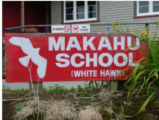
Makahu School sign (Makahu means 'white hawk')

The school at this stage was prospering, with the roll remaining in the 30's. In May 1971, the junior room was extended by 108 square feet, and a work bay, storage shelves and an additional exit were built. The two rooms were also supplied with blackout curtains and vinyl. By 1980, however, the school roll had dropped down to 25, and so the school went back to having only one teacher.