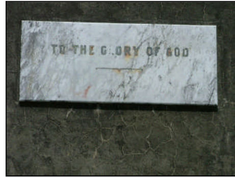
To the Glory of God