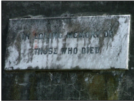
In Loving Memory of those who died

Somewhat unusually, there are no names listed on this memorial but the four plaques on it are pictured below.