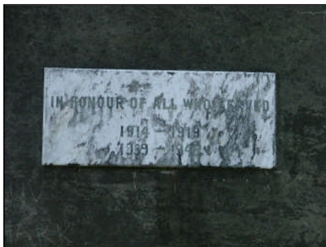
In Honour of all Who Served 1914-1919 1939-1945